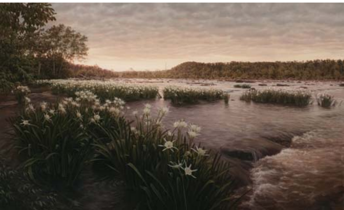
Anthony Shoals, Broad River, Georgia. Oil on Canvas , 40" x 66", August 2009.